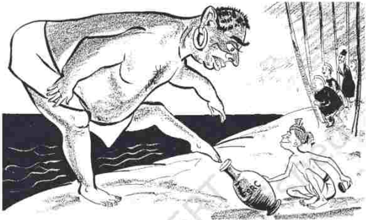
"Coaxing the Genie back" (5 February 1956) asked if the State Reorganisation Commission could contain the genie of linguism.