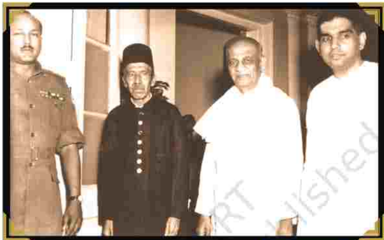
Sardar Patel with the Nizam of Hyderabad