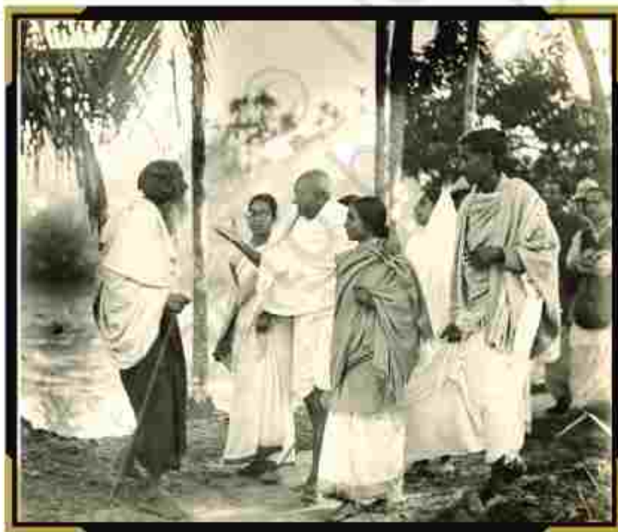
Gandhi in Noakhali (now in Bangladesh) in 1947.

The Partition was not merely a division of properties, liabilities